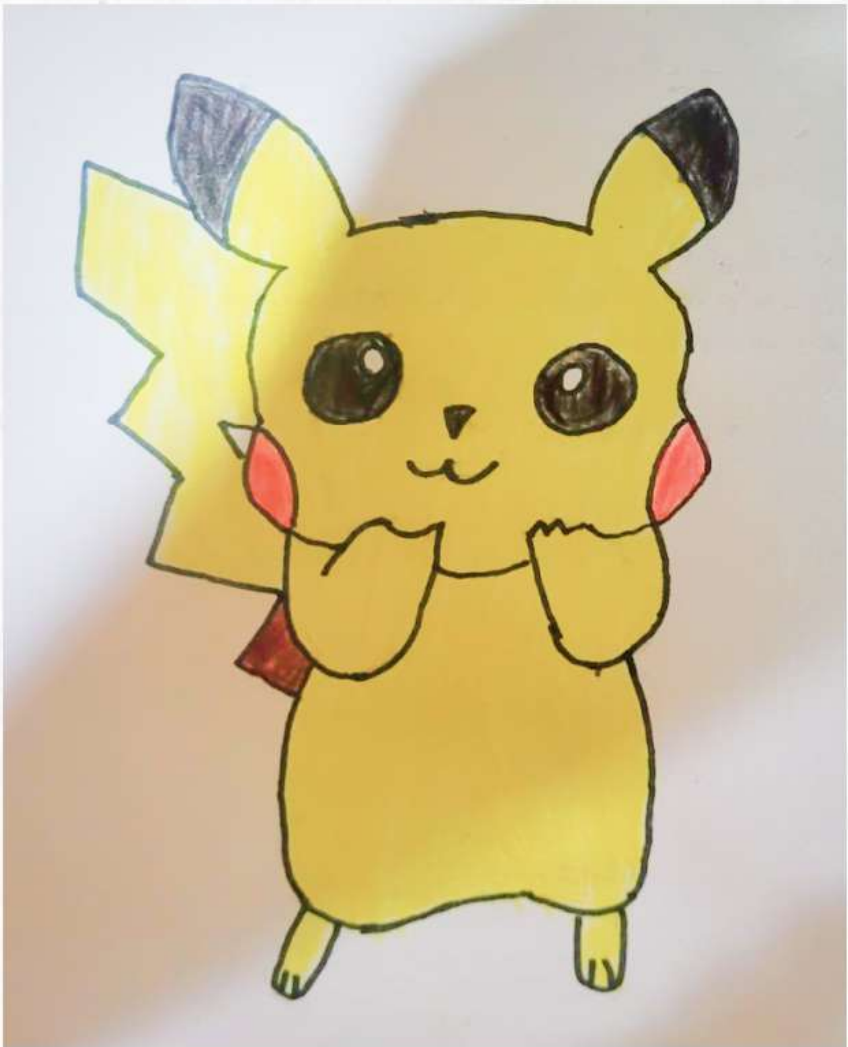
LAVANYA ATUL BANSAL